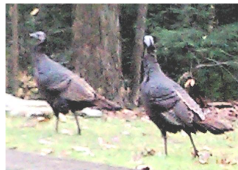
Two Greenwood residents very happy Thanksgiving is over.