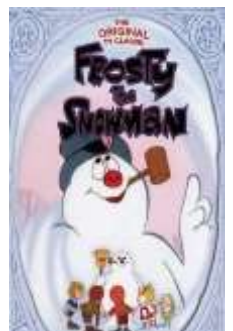
Tuesday, Dec. 31

Watch GVCA's Facebook page and website for the latest updates.