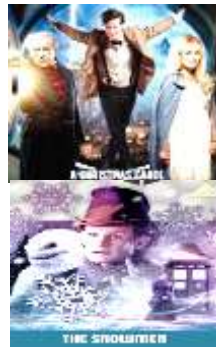
Thursday, Dec. 26