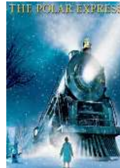
Friday, Dec. 27