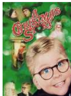
Sunday, Dec. 29