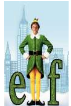
Saturday, Dec. 28