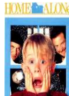
Monday, Dec. 30