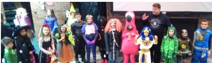
(See our website for more pictures from the party!)

Dear Greenwood Residents - we had a wonderful turnout for Halloween at the Haunted Clubhouse on Friday, October 27. There were exciting costumes worn by young and old alike. Trick-or-Treaters went home with full goodie bags and fun memories of the spooky maze and scary monsters they encountered. Thank you to the residents and staff who make "The Haunted Clubhouse" one of our most popular events!